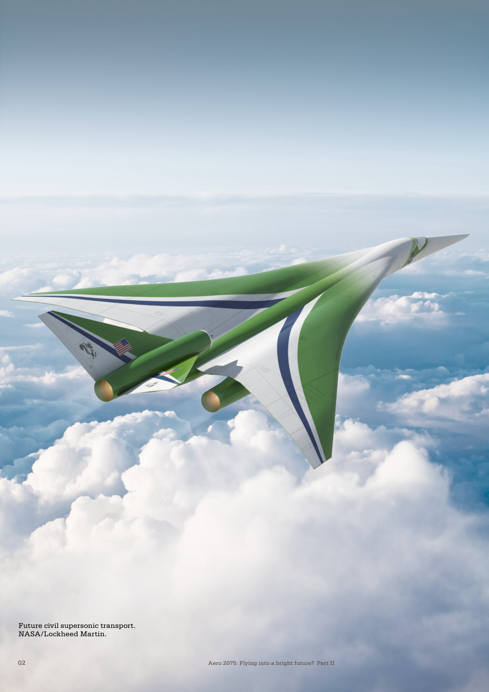
Future civil supersonic transport. NASA/Lockheed Martin.