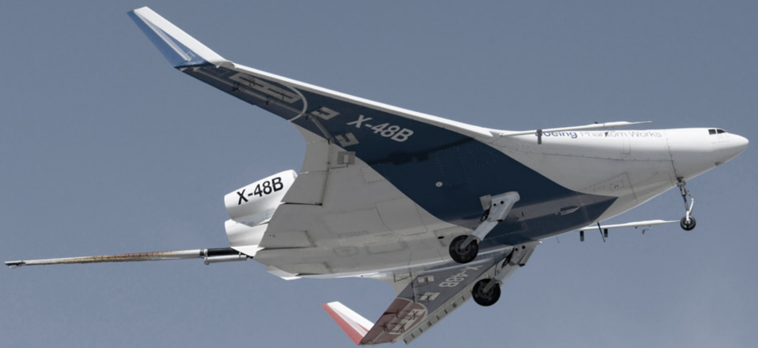
Boeing Phantom Works X-48B blended wing body.