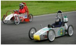
CIRCUIT LAP: the Carmel RC College entry passes a competitor at Croft

A TEAM from a school in Darlington took part in an electric car endurance race at Croft Circuit this week.